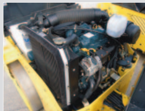
Easy access engine and drive components for simplified servicing

With these features and many more, it's easy to see why this model maintains a high residual value while delivering lower lifetime operating costs.