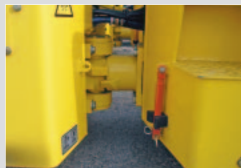
Bolt-on center-joint, with standard crab steer off-set, provides long life and ease of repair.