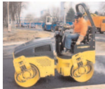
BW120AD-4 rolling a curbline shown with optional folding ROPS.