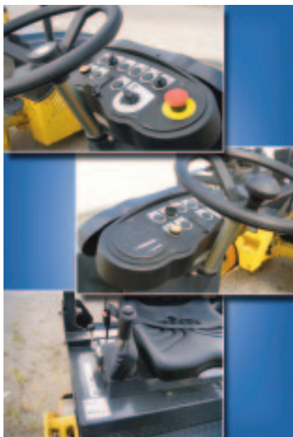
Ergonomically engineered operator's platform providing optimum comfort and maximum productivity.