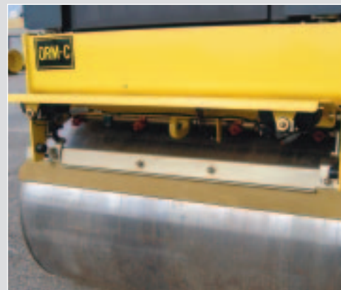
Wind protected, quick-disconnect spray nozzles with dual scrapers per drum.