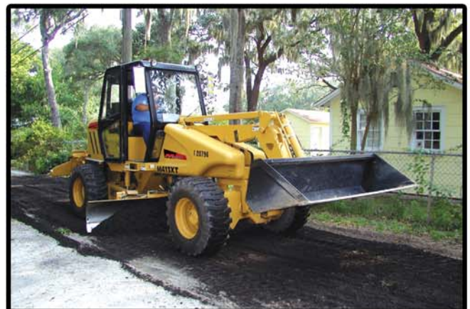
The M413XT's small footprint makes it the perfect choice for working in tight areas like this alley.