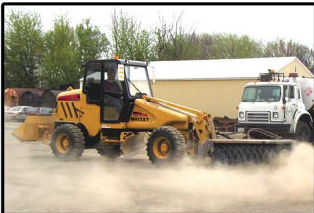
M413XT with 84 inch Broom Attachment adds versatility and productivity to this work horse.

If productivity, versatility and low maintenance are your requirements in a motor grader... MAULDIN's M413XT is the Answer!